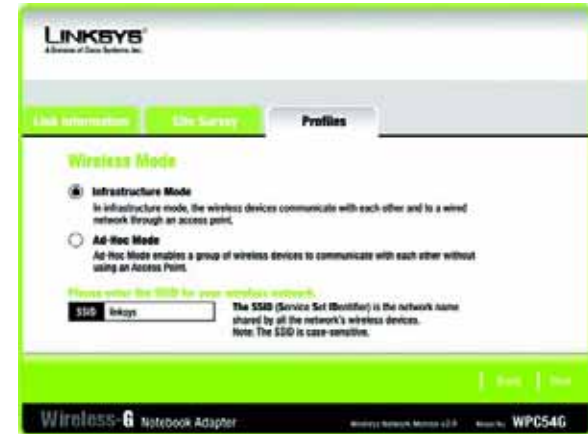
Figure 6-10: Wireless Mode for New Profile

SSID - The network name. It must be used for all the devices in your wireless network. It is case sensitive. It should be a unique name to help prevent others from entering your network.